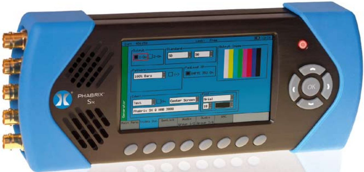
PHABRIX™ SxD Generator/Analyser/Monitor Dual Link