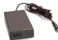
Carry case and AC power supply as standard